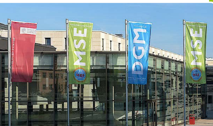
Technische Universität Darmstadt, Germany

the online participation through a browserbased web congress platform and the possibility to watch all contributions on-demand for 14 days after the congress